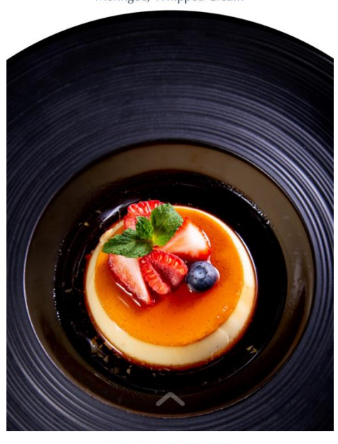
水果与"奈似雪糕" Fruits and "NICE CREAM"